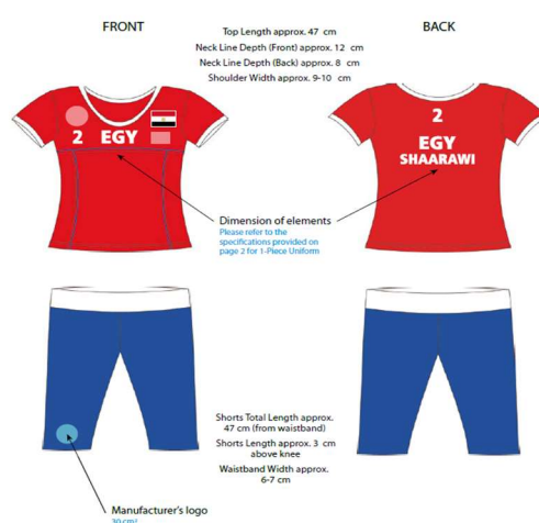
A Half Sleeve Top and Knee Length Pants (Diagram 2)

The NO SLEEVE TOP (as per Diagram 3) must fit closely and the design (see diagram) is recommended to feature neck line depth (front) of 12 cm and neck line depth (back) of 8 cm, the shoulder width of 5-6 cm and the bias tape at the neck line of 0.7 cm.