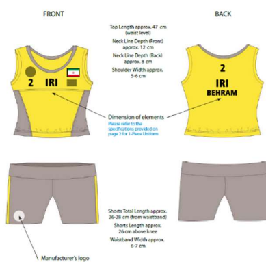
No Sleeve Top and Shorts (Diagram 3)

The SHORTS (as per Diagram 3) must be in accordance with the enclosed diagram, be a close fit and the design is recommended to feature total length of 26-28 cm (from waistband) and 26 cm above the knee, a waistband of 6-7 cm wide.